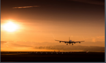
10 Hydrogen powered aircraft: The future of regional air travel?