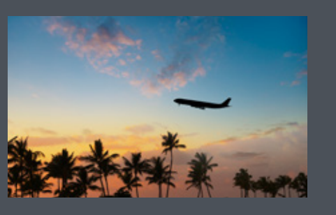
4 Legal news round-up Significant global developments