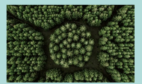
10 Sustainable financing in aviationGreen shoots or just greenwash?