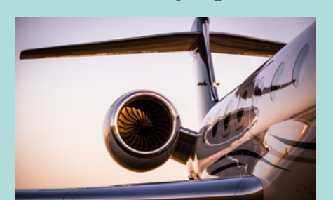
illegal charter activity across asia pacific Our joint survey with the Asian Business Aviation Association (AsBAA).